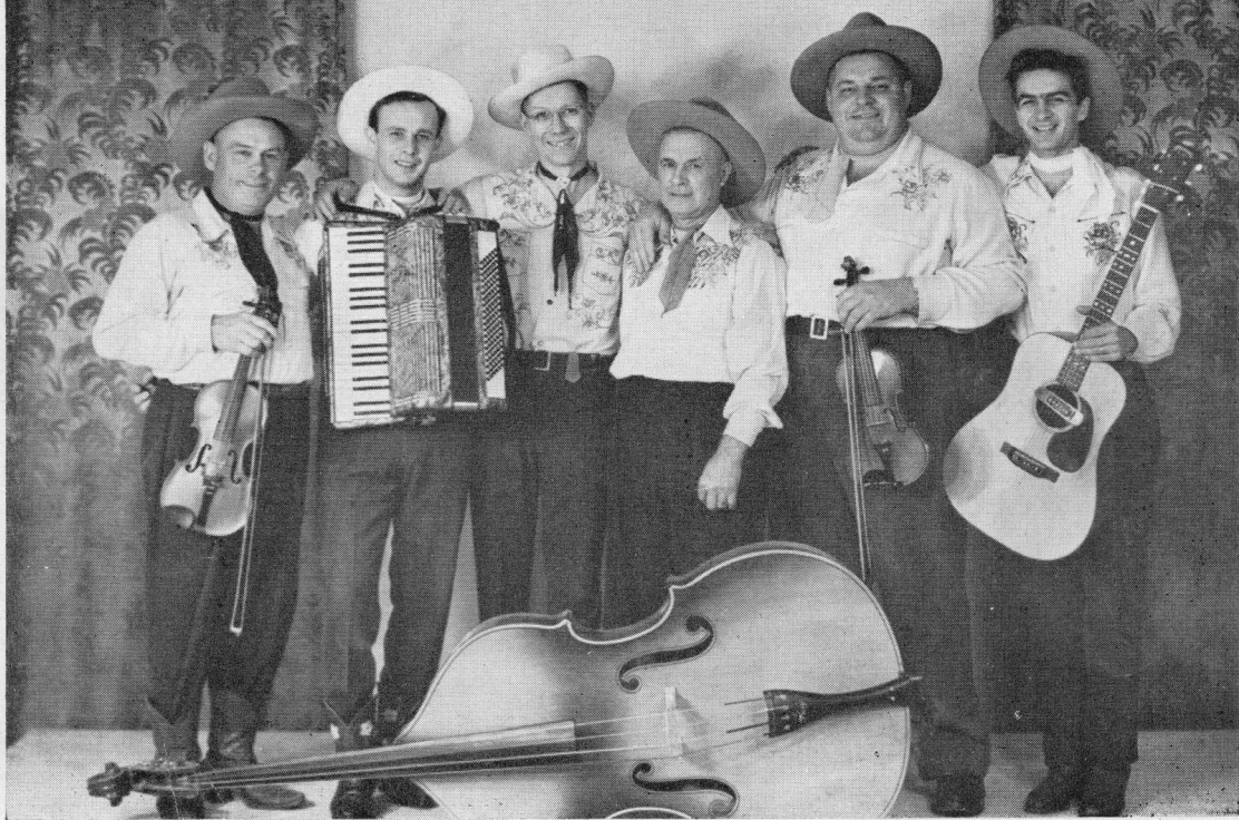
RANCH BOYS GROUP